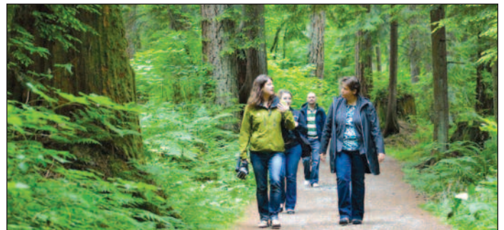
Talaysay Tours – "Talking Trees"

Talaysay Tours – 90-minute tours of Stanley Park, led by a First Nations' descendent.