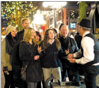
Forbidden Vancouver Walking Tours

Vancouver Water Adventure – a fast paced water tour of Vancouver and vicinity.