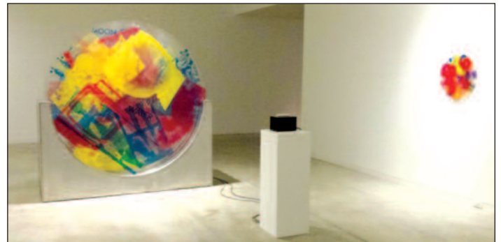
Vancouver Art Gallery

Vancouver Foodie Tours – Granville Island Market Tour (recurring weekly Thursday – Sunday) – two hours of "a perfectly crafted culinary journey through the world-famous Granville Island Public Market" including exclusive tastings. This was the #1 rated tour on TripAdvisor. Also highly rated is the Gastronomic Gastown Tour (Wednesday through Sunday).