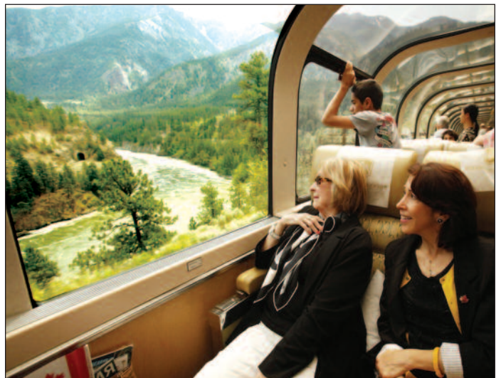
Rocky Mountaineer Train excursion

Vancouver is also a gateway to Whistler, the Canadian Rockies, Victoria, Vancouver Island, the Gulf Islands, and the Okanagan Wine Valley, so there are many reasons to come early and stay late. Consider the Rocky Mountaineer Train excursion from Vancouver to Jasper or Banff, with absolutely spectacular scenery. Vancouver is also the home port for Alaska cruises from May through October.